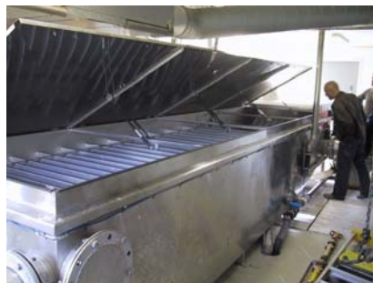
Type SF Floc