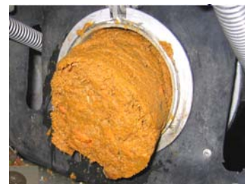
Vegetable/fruits industry: carrot