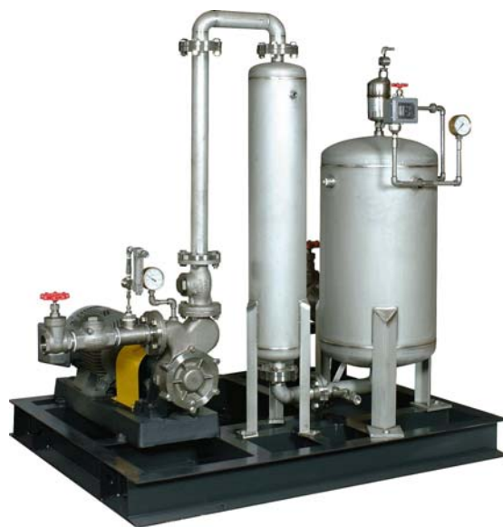
NIKUNI WIB UNIT